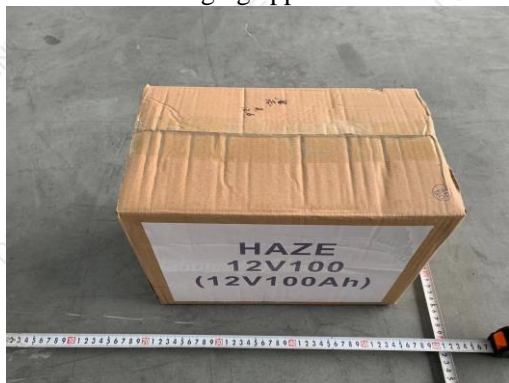
包装外观 Packaging appearance