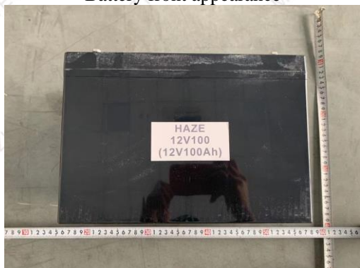
电池正面外观 Battery front appearance