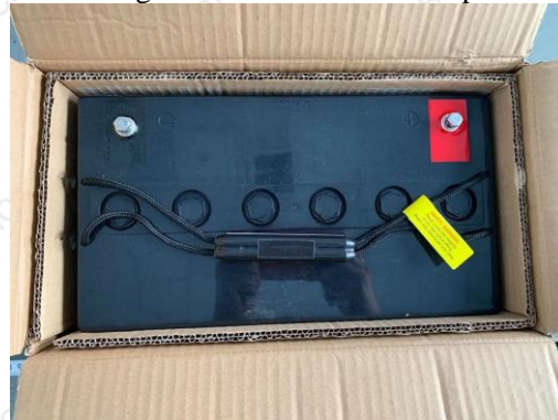
防止短路, 防移位保护措施 protection against short circuit and displacement